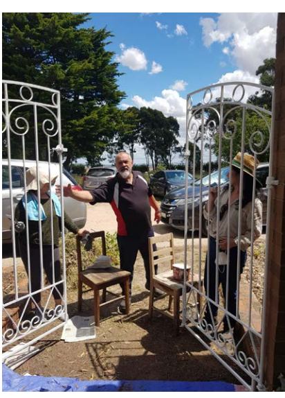
(Left) Smiles all around (Right) Lovely old gates