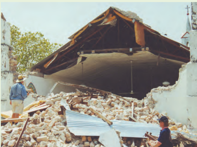
A major mishap – the precious bell tower crashed to the ground.