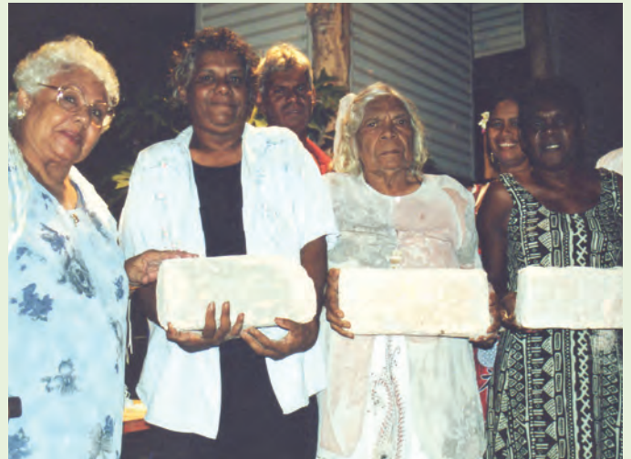
Rebuilding was immediately on the minds of the people – many hands helped in that project!!