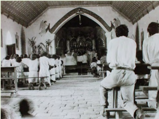
As it was: