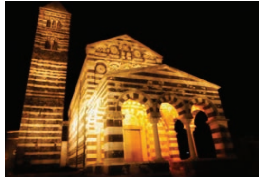
▲ Basilica of the Holy Trinity.