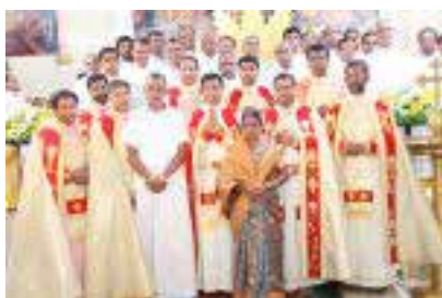
Beagle Bay Church