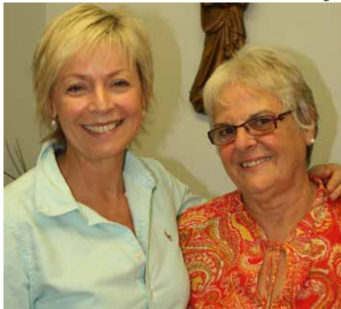
Speakers at the Celebration